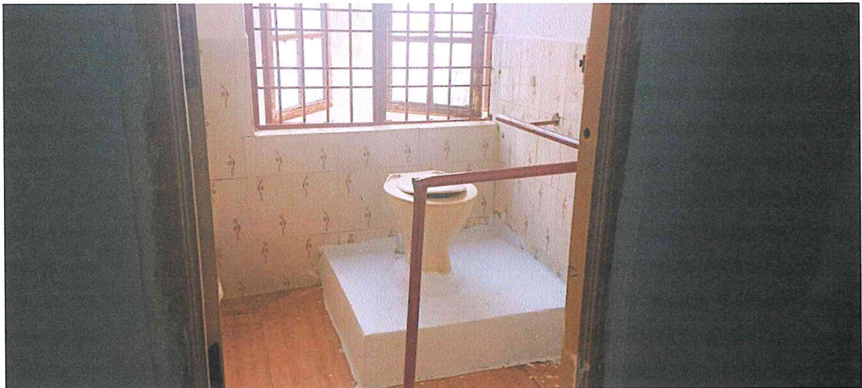
Ground Floor near EEE Department

ASIST has taken significant steps to ensure a barrier-free environment that promotes easy access for differently-abled students. The institution has implemented infrastructure modifications to accommodate the diverse needs of students with physical disabilities. The campus facilities have been designed with ramps, and accessible pathways, enabling smooth navigation across the premises. Classrooms, laboratories, and libraries are equipped with adjustable furniture, ensuring comfort and ease of use for individuals with different mobility requirements.