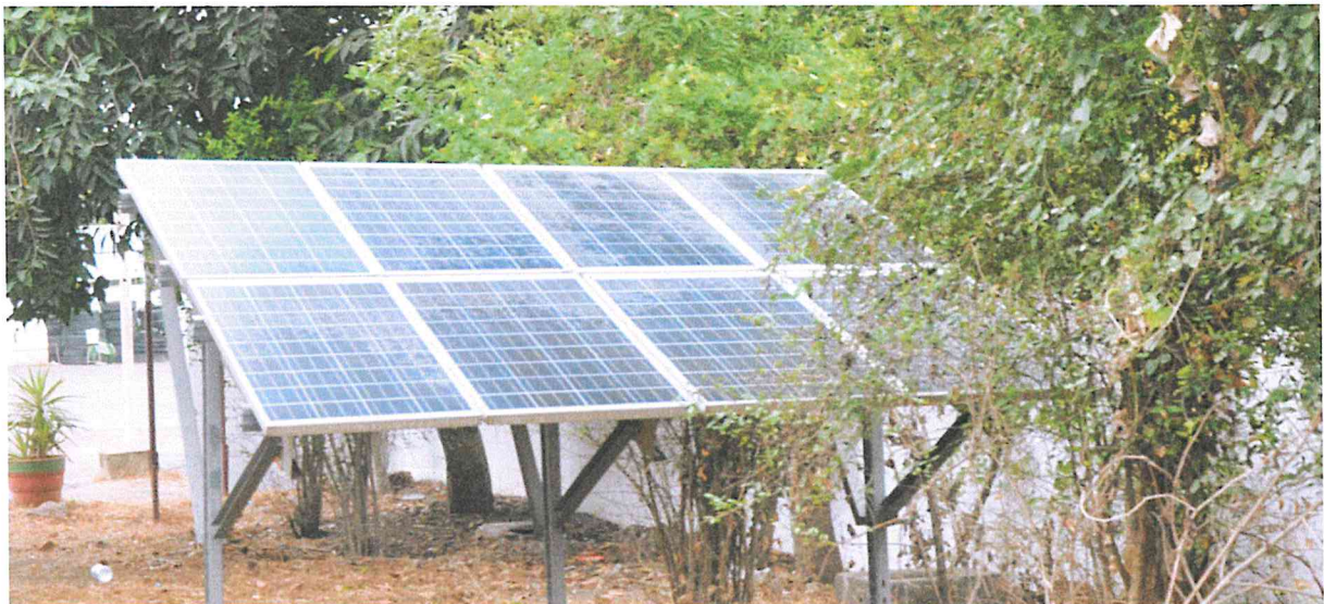
Solar Panel near the Canteen

Amrita Sai (ASIST) takes effective steps on harnessing solar energy. A 160KVA solar Photovoltaic power plant is installed on rooftops and also installed on the ground near the canteen. This Solar power has been utilized for powering few places in the campus. The solar power plant is able to generate 15600 units per month. We have also installed Generator of capacity 125 KWA. The details of the 60 KWA / 50 KWA / 2 KWA solar PV modules and geo-tagged images, are provided below.