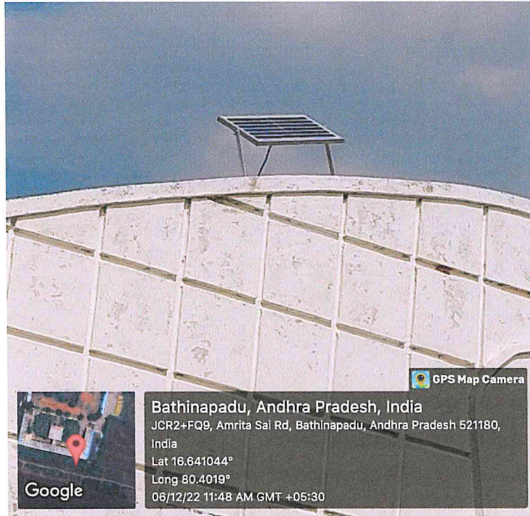
Solar Panel on the top of the main gate