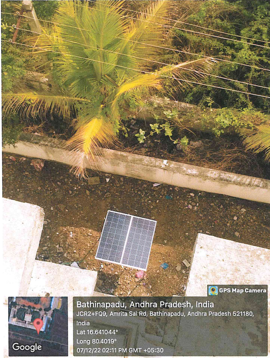
Solar Panel on the top of the main gate