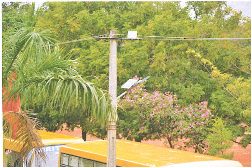
Solar Panel for the electrical poll light

IQAC Coordinator Amrita Sai Institute of Science & Technology Amrita Sai Nagar, Paritala -521180